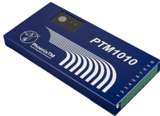
Figure 3: Fully waterproof data logger