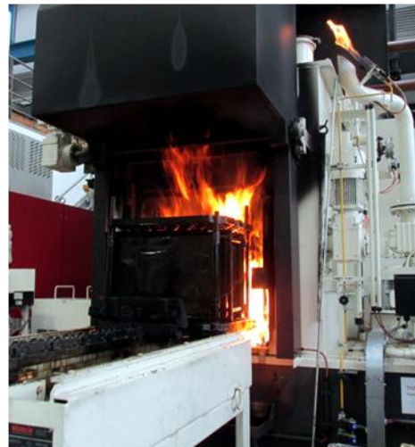
Figure 5: A 'Hot Box' oil quench system is discharged from a carburising furnace after passing through the oil quench