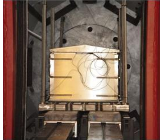
Figure 4: 'Hot Box' system with quench deflector carrying out a TUS in a vacuum furnace