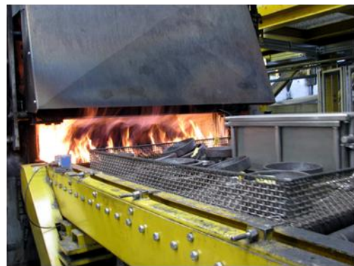
Figure 6: A 'Hot Box' system is charged into a roller hearth gas carburizing furnace terminating in a salt bath quench