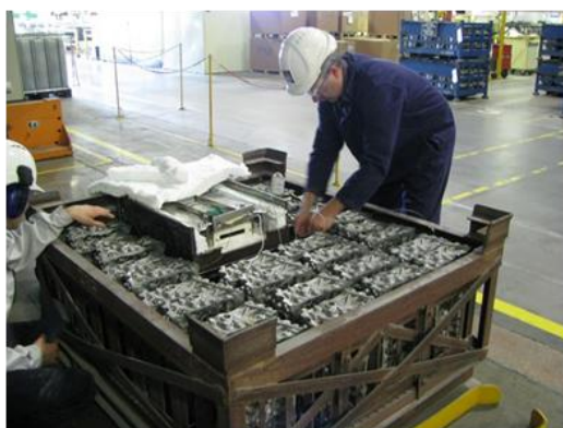
Figure 2: A 'Hot Box' system is prepared for a trial in an aluminum foundry measuring cylinder head temperatures through a water quench

The principle of monitoring is the same for all processes, but the design of the system will change according to the process. In general thermocouples are set into dummy products which are placed in strategic positions around the product basket. The temperature data is fed back to the logger which is always protected by a thermal barrier. The system is placed in the product basket which will travel together with the parts being processed through the furnace and into the quench (see figure 2). After this the test basket will generally transfer into the processes downstream (further heat treatment ovens, wash processes, etc.), before arriving at a