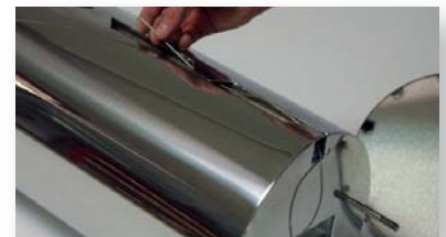
Integrated slot along length of thermal barrier for thermocouple protection within boundaries of the product

Evaporation technology combined with high efficiency insulation for ultimate size / performance ratio.