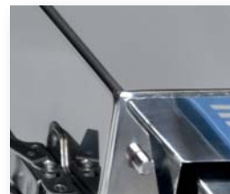
High temperature materials and highest quality workmanship!