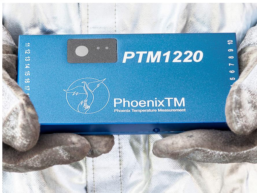
Fig 1: PhoenixTM PTM1-220-HT data logger designed specifically for monitoring the most demanding of steel reheat processes. Providing up to 20 measurement channels with choice of type K or N thermocouple types with a data logger accuracy of +/- 0.3 °C. Designed to operate safely for extended periods at 100 °C / 212 °F.

Passing through the reheat furnace reaching temperatures of up to 1300 °C / 2372 °F, for up to 8 hours, the data logger requires significant thermal protection. Such protection is provided by the specially designed TS07 thermal barrier range. Manufactured using graded insulation layers and an evaporative inner water tank, the phased evaporation of water maintains the logger temperature at a safe 100 °C / 212 °F. The thermal barrier is placed on the slab/billet (Figure 2.2) or in circumstances where height clearance is an issue, located in a space machined out of the end of the test slab/billet, supported on hanger bars/plate welded to the slab.