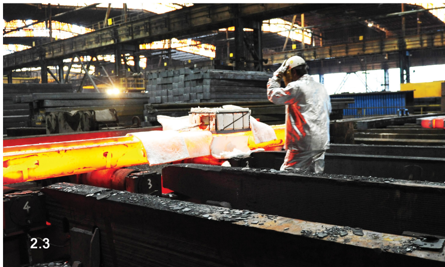
Fig 2: (2.1)Phoenix TM Profiling system showing typical thermal barrier design (thermal blanket insulated water tank) and data logger held in insertion tray. (2.2) System pre-run installed on steel blank. (2.3) System post reheat furnace. Thermal barrier (TS07-300-3 provides 3.2 hrs protection at 1300 °C / 2372 °F) loaded on cast steel beam blank reheated prior to rolling into structural metal work for buildings/skyscrapers. The Phoenix TM 1220 data logger at the core of the system stores data measured by the thermocouples inserted into the steel blank at varying depths along its length.

at a higher cost. Final selection is made considering accuracy and temperature range. Type N are more stable at high temperatures and therefore have better accuracy but have an upper limit of 1300 °C / 2372 °F. Type K in comparison has an upper limit of 1370 °C / 2498 °F. Having selected the thermocouple type the final choice is the diameter and length of the thermocouples to match the dimensions of the slab being monitored. Typically, 3 mm (0.12 inch) diameter MI probes are used to reduce the risk of break down of the magnesium oxide insulation and resulting risk of “shunt impedance” errors.