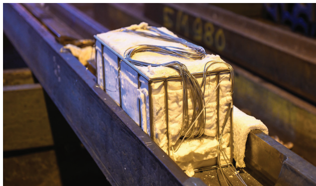
Fig. 5. Thru-process profile system installed ready to run through the reheat furnace. Thermal barrier provides 3.2 hours protection at 1300°C (2372°F). It is loaded on a cast-steel beam blank, which is reheated prior to rolling into structural metalwork for buildings/skyscrapers. The datalogger at the core of the system stores data measured by the thermocouples inserted into the blank at varying depths along its length.

Thru-process systems are available to provide such data, offering up to 20 thermocouple inputs. This allows temperatures to be measured at the surface, center and base of the product at various positions along its length. The resulting temperature-profile data can be imported directly into the furnace controller model to validate correct selection of process parameters and assumptions applied.