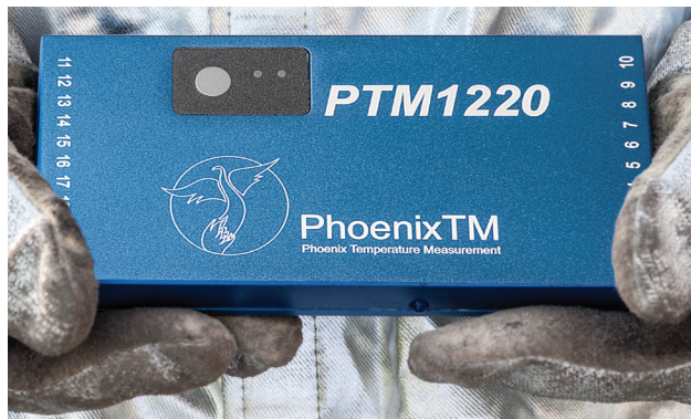
Fig. 1. Typical temperature datalogger (up to 20 thermocouple inputs) used in the thru-process system. Protected by a thermal barrier, the logger travels through the furnace with the product being monitored.

The measurement of the product temperature profile has