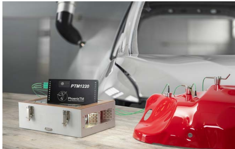
Phoenix™ TS64 Optic system. Thermal barrier is shown configured with a PTM1220 20 channel data logger and finishing thermocouples, including the new compact MiniMag magnetic thermocouple.

The Phoenix™ Optic system allows thru-process paint defect detection using Optical Profiling. The high-resolution video camera can safely travel through the paint oven with an independent torch recording video footage of what the product sees. The system is just like your car 'Dash Cam' the only difference being that the journey is through a cure oven operating up to 200 °C. The Optic system can be mounted on a test body allowing monitoring of the exterior of a separate production body shell or potentially directly on a production body itself.