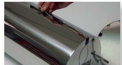
Integrated slot along length of thermal barrier for thermocouple protection within boundaries of the product

Evaporation technology combined with high efficiency insulation for ultimate size / performance ratio.